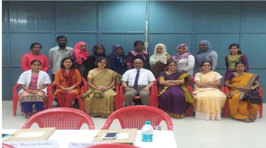
Teachers from Maldives with the teams from Com DEALL and SRCISH

08 Teachers from Maldives were trained between 8 th to 15 th June 2016. This training was conducted jointly by Dr. SRCISH and The Com DEALL Trust