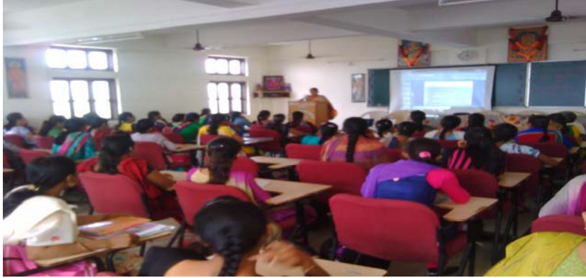
Awareness program at Com DEALL unit at Bhuj

Com DEALL unit at Bhuj conducted two awareness activities one for school teachers, administrators and parents of young children with Autism in the month of September and a second one for B.Ed. training teachers at the local B.Ed. training college. Approximately 50 teachers were sensitized.