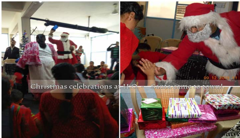
Christmas celebrations at H.O. — Santa came to town!

The Parents association organized Holi festivities Christmas Day Celebrations, outings for the children to Lumbini Gardens and Cubbon Park.